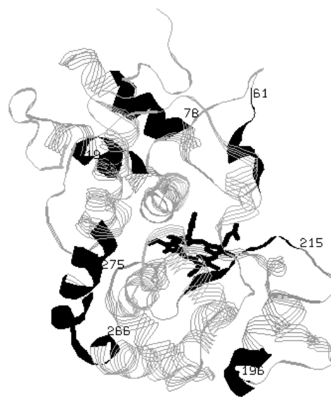
Fig. 2. Schematic representation of epitopes inherent only for apo-peroxidase on the spatial model of HRPc. Regions of the polypeptide chain involved in epitopes are shown as dark solid tapes. The figure also shows the heme.

Figure 1 presents the patterns obtained for anti-apoHRP antiserum and anti-holoHRP antiserum modified in the way described above. First of all, we revealed that the most part of epitopes found earlier as specific for holo-HRP [11] are also peculiar for apo-form. At the same time we detected the increased total amount of epitopes for apo-HRP. Both NH 2 -terminal and COOH-terminal regions of apo-HRP were found to become more immunogenic. Several epitopes (19, 61, 78, 196, 215, 266, 275) were detected only for apo-form. Some epitopes revealed for holo-HRP were detected also for apo-form but with certain shift by 1–2 amino acids (19, 75, 266). This is an evidence for partial unfolding of the protein molecule in these regions, and more immunogenic amino acids become more accessible. At the same time we revealed only weak binding of antibodies towards apo-HRP with some of peptides established as epitopes for holo-HRP (138, 142, 126, 154), and some of them include the amino acids which are functionally significant and are involved in the channel through which aromatic substrates gain access to the \delta -meso carbon of the heme ring. In general, apo-HRP was established to be more immunogenic when compared with holo-peroxidase.